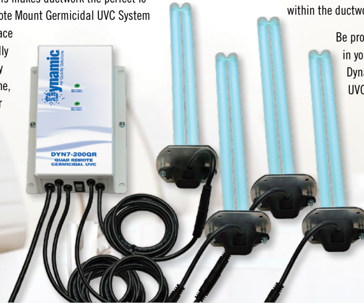
Remote Mount Germicidal UVC System

Be proactive and protect the airspace in your building TODAY with a Dynamic Remote Mount Germicidal UVC System.