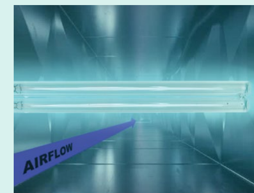
One 16" UVC lamp Typical 5 ton air handler*

Considerations: Duct dimensions and air flow will determine the proper application of any germicidal UVC lamp system. The effectiveness of germicidal UVC depends on the length of time a microorganism is exposed to UVC, the intensity and wavelength of the UVC lamps, and their configuration within the HVAC duct system.