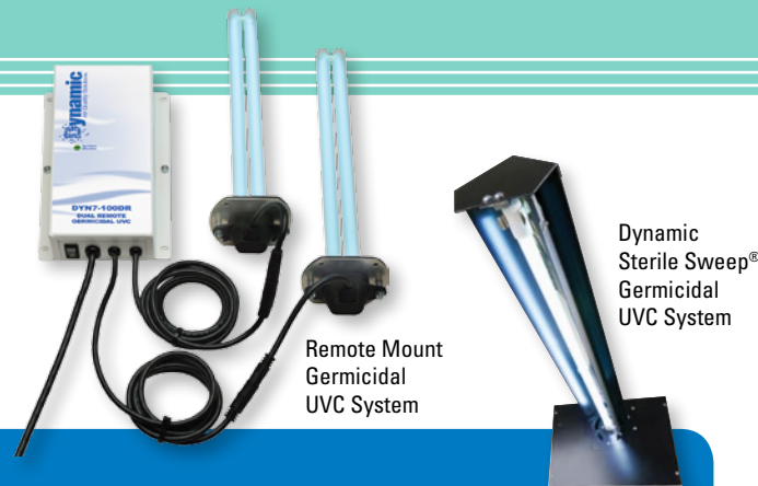
Remote Mount Germicidal UVC System

From the original 24Volt 1" Dynamic Air Cleaner to the state-of-the-art Dynamic V8, Dynamic has the right product to fit your application. Dynamic Air Cleaning Systems can be configured to provide the absolute best possible air cleaning solution for your application.