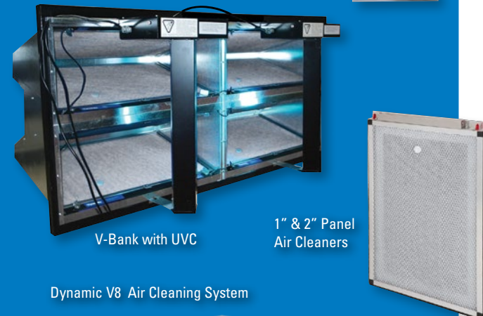
V-Bank with UVC

3 Dynamic V8 Air Cleaning Systems offer MERV 15+ performance and the ability to capture viral aerosols and odors. Its very low resistance to airflow and industry-leading dust-holding capacity allow it to be retrofitted into many systems that were designed for low-efficiency filtration. The Dynamic V8 can be installed in large central modular arrays in air handlers and fan-powered boxes or dispersed in individual modules to replace a section of duct or with smaller equipment.