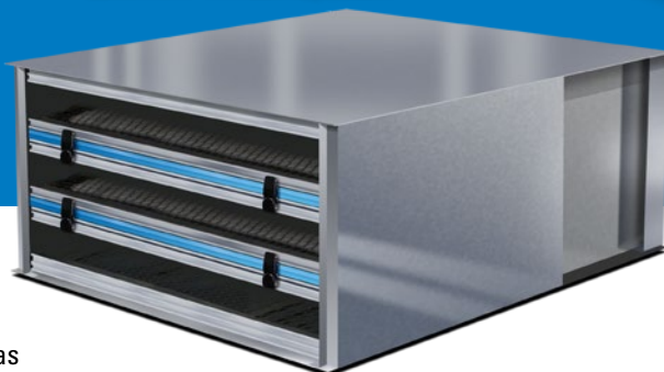
Dynamic V8 Air Cleaning System

Dynamic Air Quality Solutions has a range of products and over 30 years of experience designing systems that are optimized for the control of particle, biological, and gas phase contaminants, while providing significant energy and operational savings over traditional alternatives.